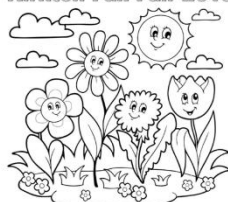
"Still Growing Strong"