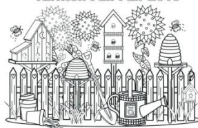
"Still Growing Strong"